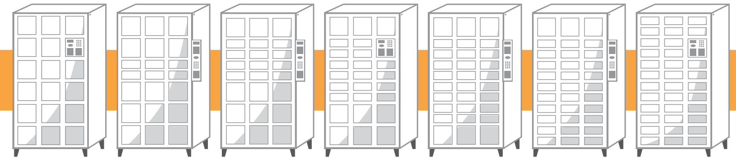
ACCESS 6017 17-Door Locker Weight: 385 lbs.