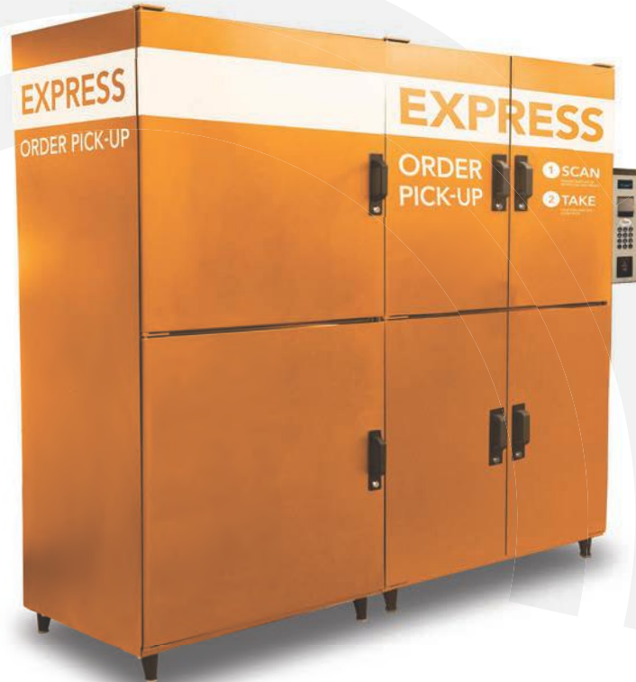
Access™ 6002.HM and 6004.M