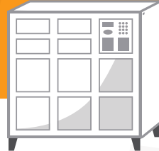
AXCESS 6110.3 3-High 10-Door Locker Height: 42" Weight: 160 lbs.