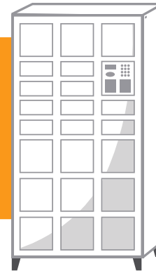
AXCESS 6122.6 6-High 22-Door Locker Height: 78" Weight: 250 lbs.