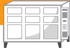
AXCESS 6109.2 2-High 9-Door Locker Height: 30" Weight: 120 lbs.