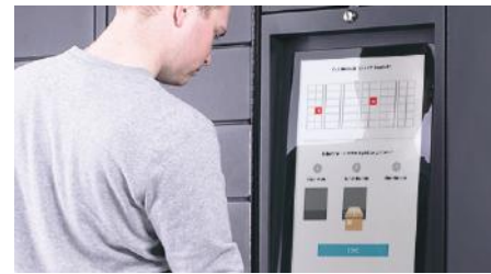
NEW Attractive, User-Friendly Touchscreen Kiosk

A variety of features provide accommodations for users with disabilities