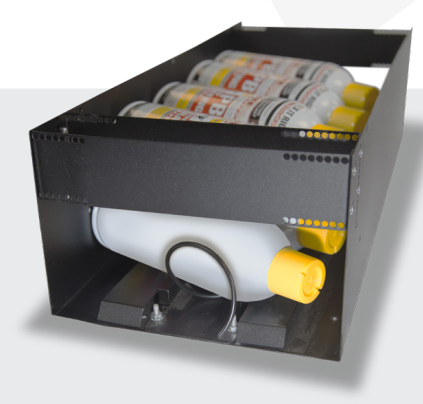
Our exclusive Versatile Dispensing Modules (VDM) provide single-item dispensing of batteries, aerosol cans and other hard-to-vend items.

Dispense up to 60 SKUs with limited repackaging needed.