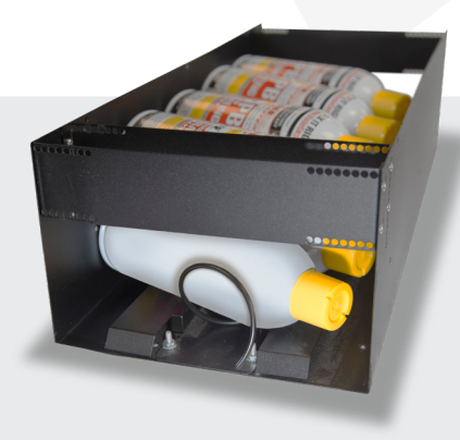
Our exclusive Versatile Dispensing Modules (VDM) provide single-item dispensing of batteries, aerosol cans and other hard-to-vend items.

Dispense up to 60 SKUs with limited repackaging needed.